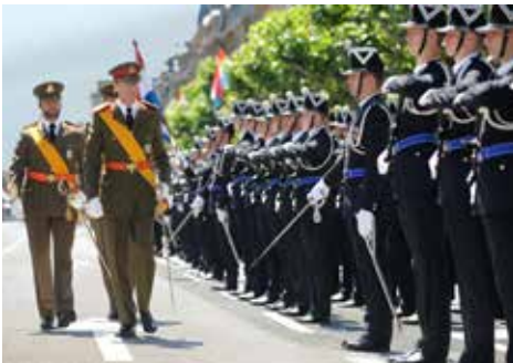
HRH the Grand Duke, followed by his son the Hereditary Grand Duke, attending national day celebrations

The Constitution gives the Grand Duke the formal right to organise his government freely, i.e. to create ministries, divide up ministerial departments and appoint their members. In practice, the Grand Duke is guided by the results of the five-yearly legislative elections in his appointment of an