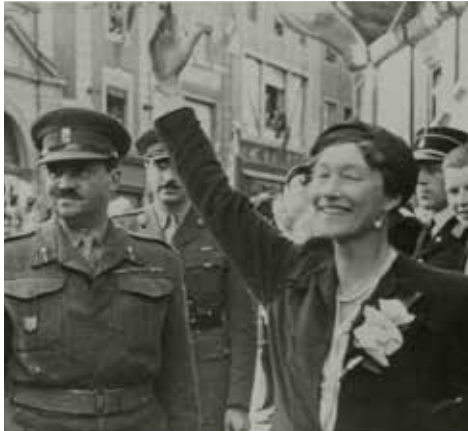
The Grand Duchess Charlotte in 1944

In September 1919, the Luxembourg government decided to organise a two-part referendum bearing both on the form of state (monarchy or republic) and on the economic direction of the country following the denunciation of the Zollverein. The population, which was enjoying universal suffrage for the first time, voted overwhelmingly in favour of the monarchy and an economic union with France. When France withdrew, the Luxembourg government forged an economic union with Belgium in 1921, the Belgo-Luxembourg Economic Union (BLEU). Luxembourg adopted the Belgian franc as the currency of the BLEU, while retaining a limited issue of Luxembourg francs.