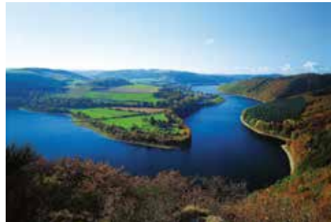
Haute-Sûre lake