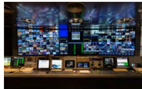
The digital network operations room of SES

In this context, in addition to a large number of small and medium-sized enterprises (SMEs), multinational names from the digital economy such as Amazon.com, eBay, PayPal, iTunes and Vodafone have also established themselves in the Grand Duchy. They confirm Luxembourg's position as a hub for companies operating in data processing, e-commerce and the communications sector in general.