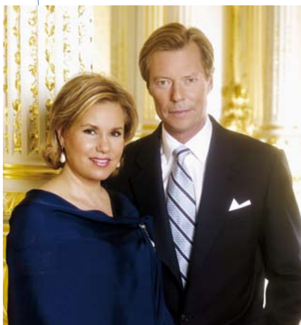
TRH the Grand Duke and the Grand Duchess

The grand-ducal family has preserved its legitimacy amongst Luxembourg society because it has been able to gain its trust in the most difficult moments: the resistance movement during the Second World War, of which Grand Duchess Charlotte was a central figure, is one of the most significant examples. Through its demeanour, the grand-ducal family succeeded in transmitting a feeling of unity to the Luxembourg people which is still one of the key factors of the country's stability today.