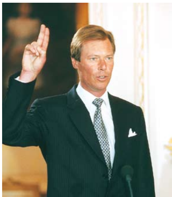
HRH the Hereditary Grand Duke takes the oath as lieutenant representative of HRH the Grand Duke Jean (4 March 1998)

Hence on 7 October 2000 Grand Duke Jean signed a grand-ducal abdication decree at the grand-ducal palace, in the presence of Grand Duchess Joséphine-Charlotte, the Hereditary Grand Duke Henri and the Hereditary Grand Duchess Maria Teresa. Her Majesty the Queen of the Netherlands, Their Majesties the King and Queen of the Belgians, other members of the grand-ducal family, representatives of the principal political institutions as well as public figures attended the ceremony.