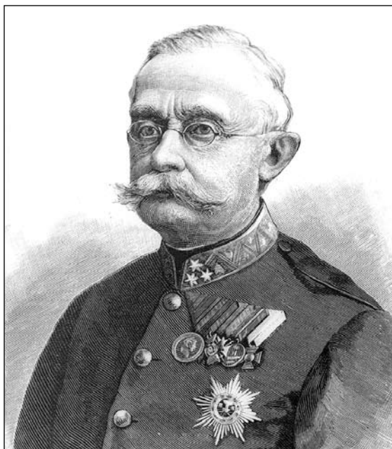
Grand Duke Adolf (1817-1905)

During the taking of the oath in Parliament, Grand Duchess Marie-Adélaïde asserted her interest in political and social affairs. Heavily influenced by her Catholic education and convinced she was sovereign by the grace of God, she claimed the right to intervene in political matters. Although she never went beyond the limits set by the Constitution, she attracted too much resentment