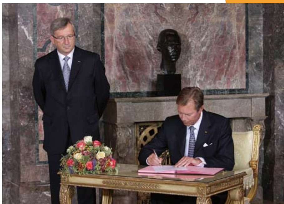
The Grand Duke promulgates the laws, decrees and treaties

The Grand Duke’s political freedom from responsibility has ministerial responsibility as its counterpart. Any measure taken by the Grand Duke in the exercise of his political powers must in fact be countersigned by a member of government who takes full responsibility.