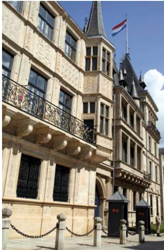
The grand-ducal palace in Luxembourg City

The interior of the palace has undergone significant changes since 1964 to give it a warmer atmosphere. The palace was completely renovated between 1992 and 1996.