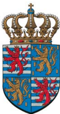
The lesser coat of arms of HRH the Grand Duke

By the grand-ducal decree of 23 February 2001 Grand Duke Henri fixed the lesser and the middle coat of arms. By the grand-ducal decree of 23 June 2001 he fixed the greater coat of arms. The coat of arms worn by Grand Duke Jean remain unaltered.