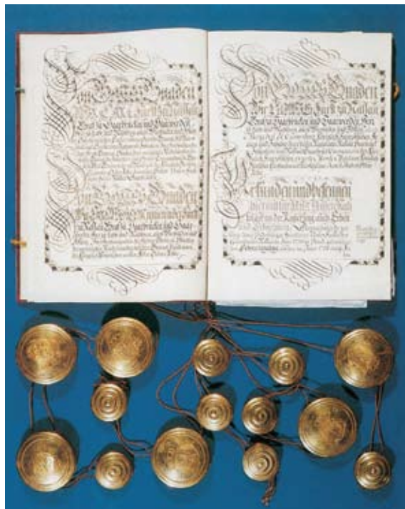
The 1783 family pact of the House of Nassau

descendant of the other branch. If there is no male descendant in either branch, the crown is handed down by order of primogeniture to the female descendant of the reigning dynasty.