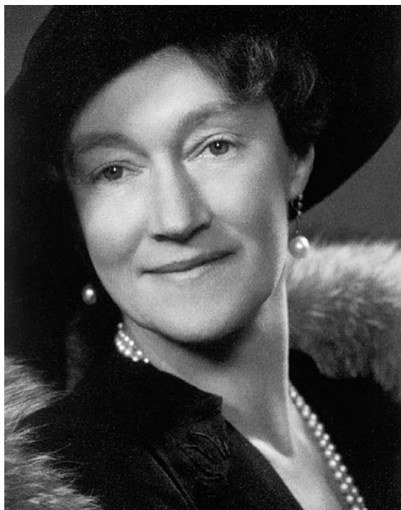
Grand Duchess Charlotte (1896-1985)

The revision of the Constitution in 1919 redefined the crown's prerogatives. It declared the nation sovereign and limited the sovereign's powers.