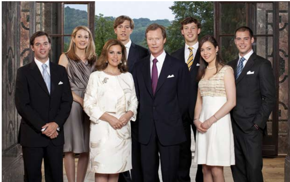
TRH the Grand Duke and the Grand Duchess with their five children and their daughter-in-law (on the left)

for young girls and women. She is very active in the promotion of microcredits. Chairing several humanitarian organisations, she strongly supports initiatives that provide women with the means to be independent and to defend their rights. The Grand Duchess therefore encourages any project aiming to improve the quality of life of young girls, women and their families through education programmes and the provision of microcredits.