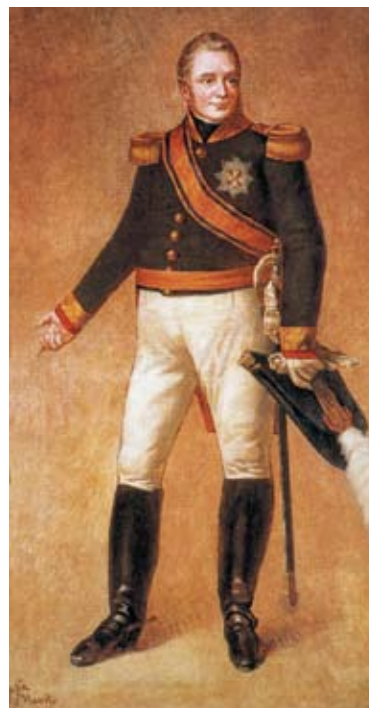
King-Grand Duke William I

The country's national identity was formed as it gradually acquired independence, and has been strengthened by the presence in the Grand Duchy of the ruling Grand-Ducal House since 1890.