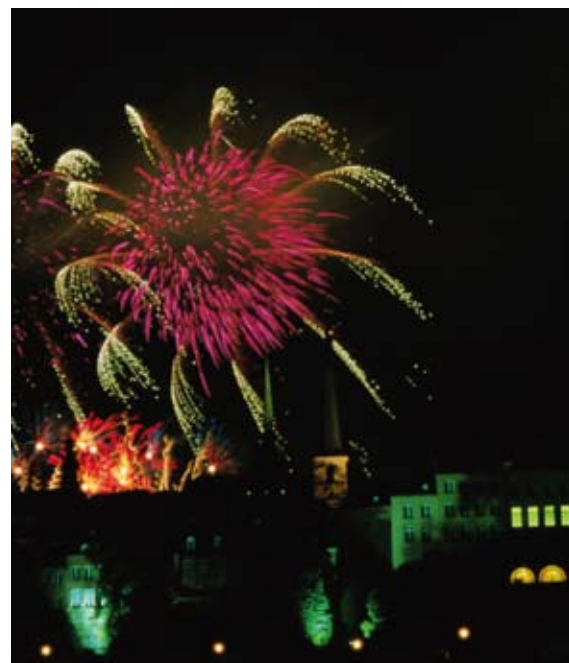
Thousands of persons gather each year in Luxembourg City to watch the traditional fireworks

The festivities begin on the evening of 22 June with visits from members of the grand-ducal family in Esch-sur-Alzette and in another town. At around 10 p.m.