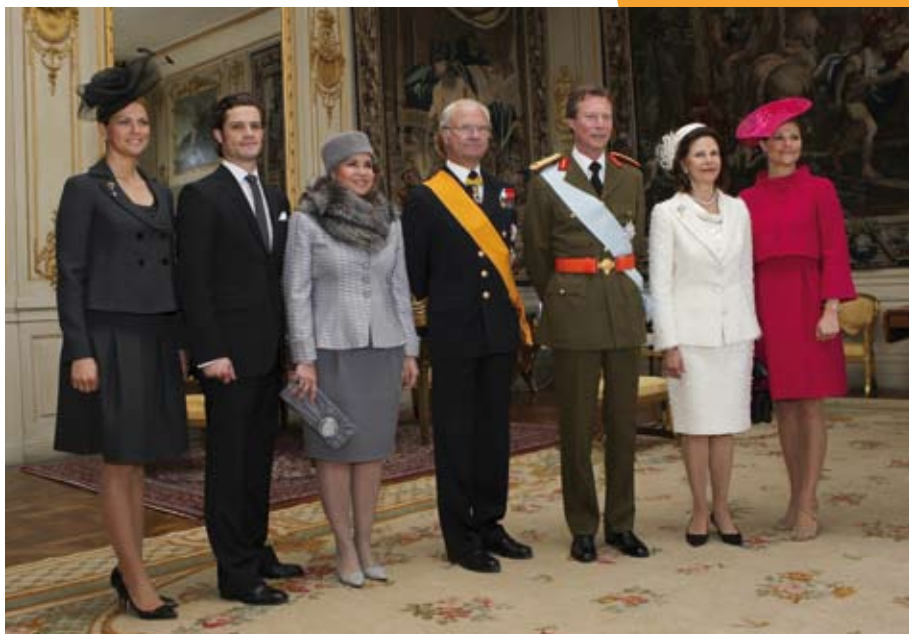
TRH the Grand Duke and the Grand Duchess with TM the King and the Queen of Sweden with their children during the state visit in Sweden in April 2008

The abdication ceremony was followed by the ceremony of the accession to the throne which was held at a formal sitting of Parliament. After taking his oath, the Grand Duke gave his enthronement speech, in which he committed himself to accomplishing the duties and obligations his new function imposes on him in all conscience and with the utmost of his ability. The day was marked by appearances in the capital of the new grand-ducal couple and by official ceremonies.