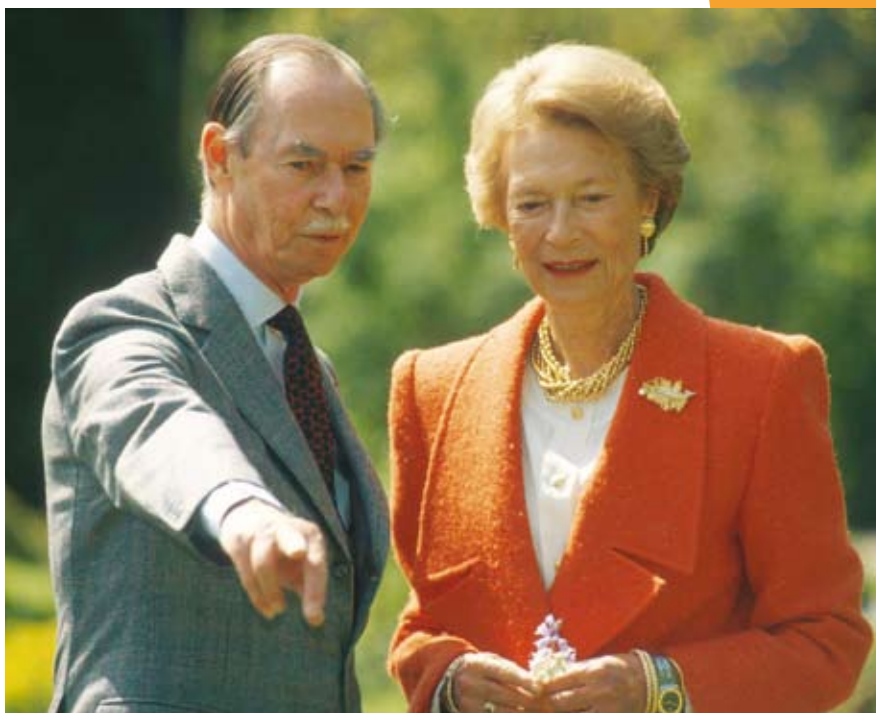
TRH the Grand Duke Jean and the Grand Duchess Joséphine-Charlotte

In addition to Lëtzebuergesch , the Grand Duke speaks French, English, German and has some knowledge of Spanish. He attended secondary school in Luxembourg and France, where he successfully gained his baccalaureate in 1974. He then went on to study at Geneva University (Switzerland), graduating in political science in 1980. His Royal Highness the Grand Duke was proclaimed Honorary Doctor (Humane Letters) of the Sacred Heart University, Fairfield, Connecticut (USA) and Honorary Doctor in Law of Miami University, Oxford, Ohio (USA). Furthermore, he was declared Honorary Doctor in Economics of the University of Khon Kaen (Thailand), Honorary Doctor in Politics of the University of Trier (Germany) and the University of León (Nicaragua).